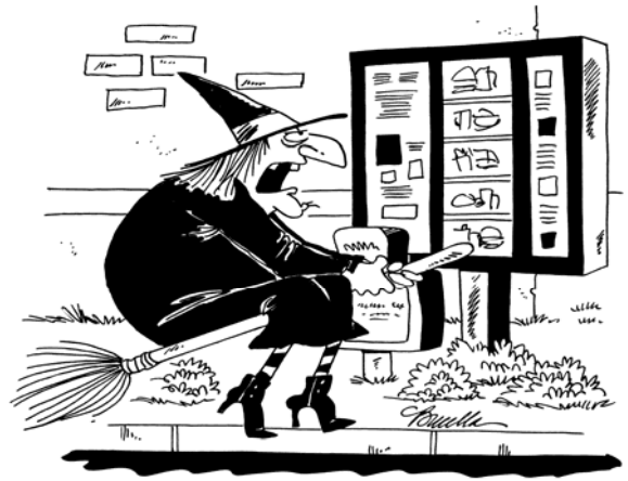
"I'd like the Hansel and Gretel value meal..."